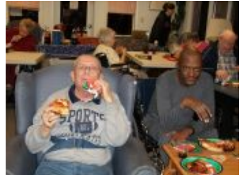
Super Bowl Party